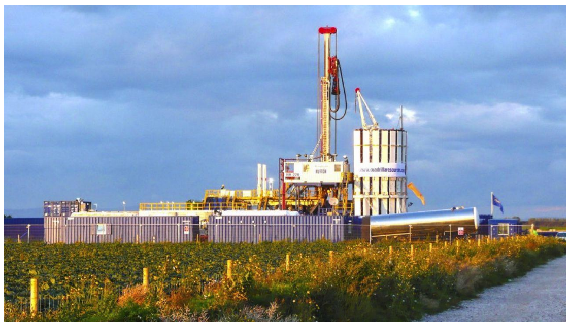
Cuadrilla's test fracking site, Lancashire, UK

This is an introduction to the basics of fracking inland gas wells which I wrote in 2013. I have made some updates, the chief of which is removal of the material relating to the possible association of fracking with earthquakes in the USA. This will be covered in detail in an accompanying Part 2.